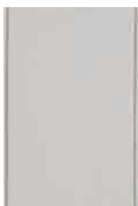
white leather with grey stitching