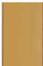
natural leather with tobacco stitching