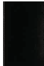
black leather with grey stitching