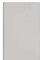
white leather with white stitching