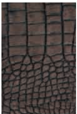
dark brown crocodile effect leather

PLEASE CALL FOR FURTHER INFORMATION AND DETAILED CATALOGUE