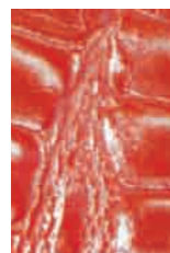
red crocodile effect leather