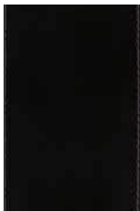
dark brown leather with lilac stitching