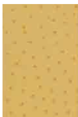
natural ostrich effect leather