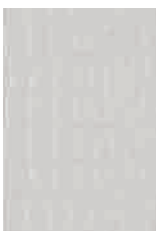
white crocodile effect leather