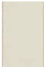
ivory leather with beige stitching